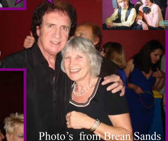
Photo's from Brean Sands