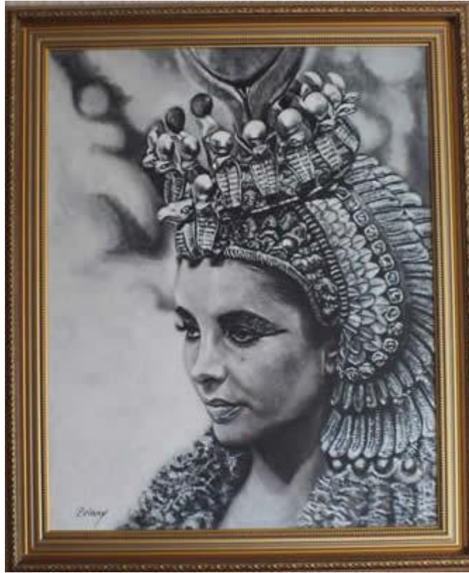
Painting size 23" x 19"

The painting will be sold to raise funds for Invisible Injuries