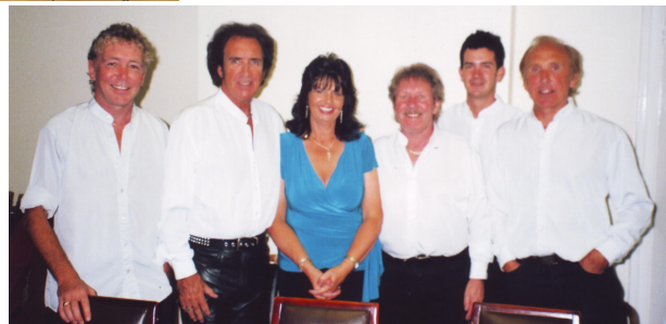
I booked THE MERSEYBEATS for my 55th Birthday